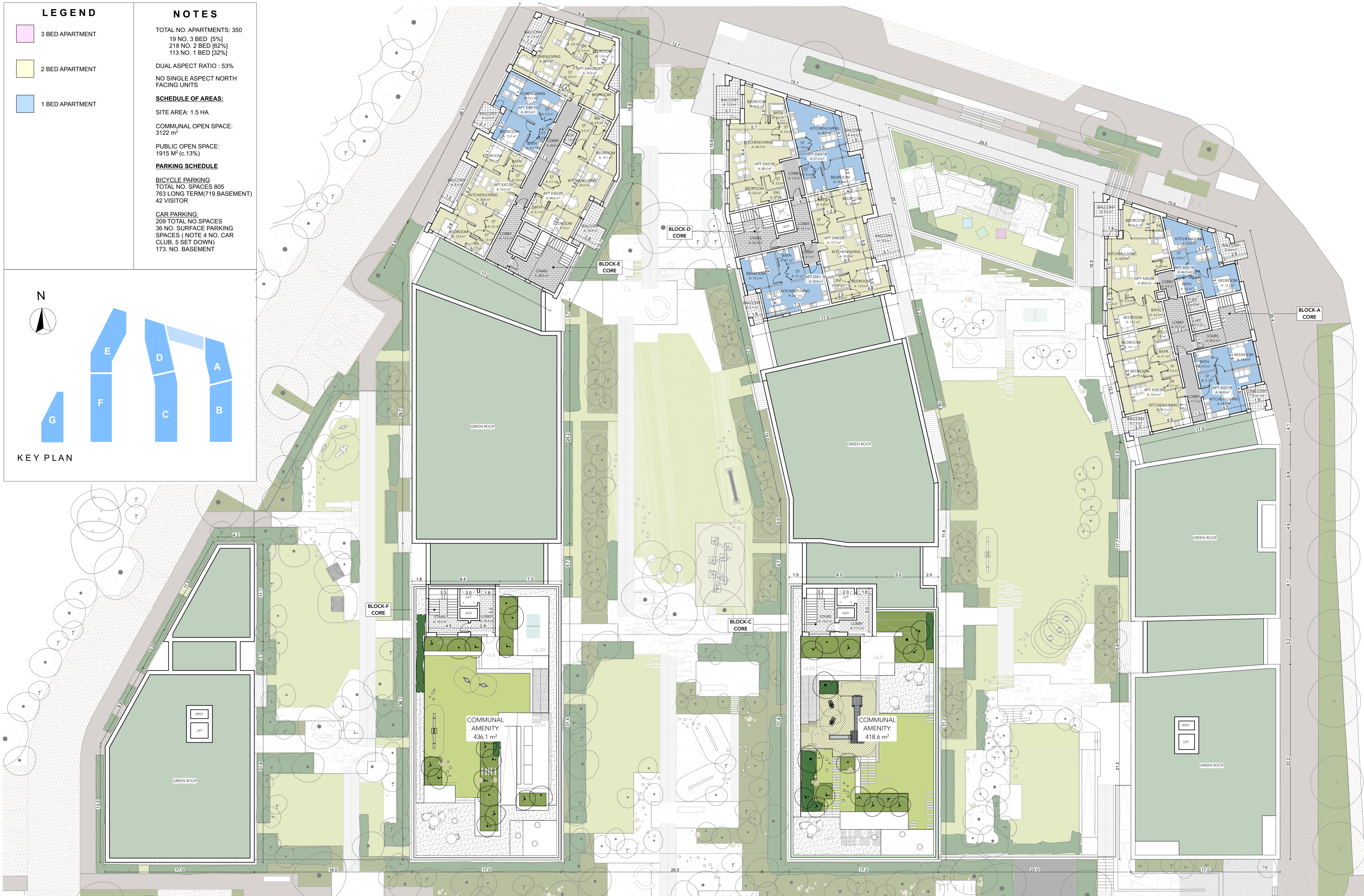
Seventh Floor Plan SCALE : 1:200